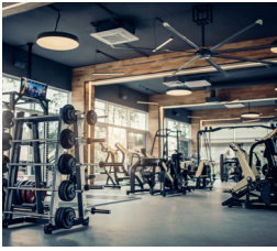
Fitness Studio Public Washroom