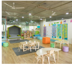
Daycare Care Home