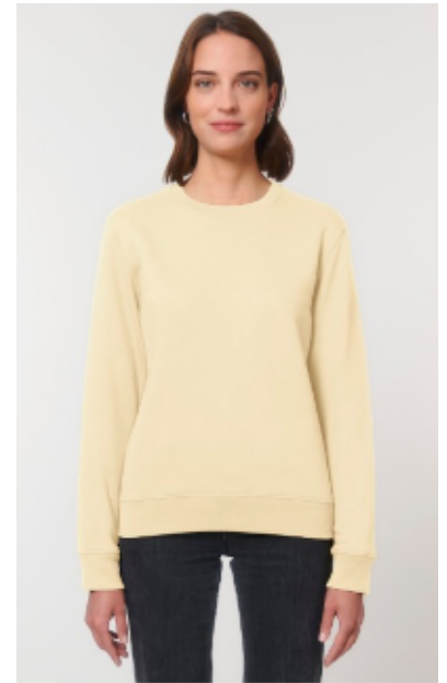
Agathe is 161 cm Size: XS