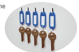
Internal Key Hooks