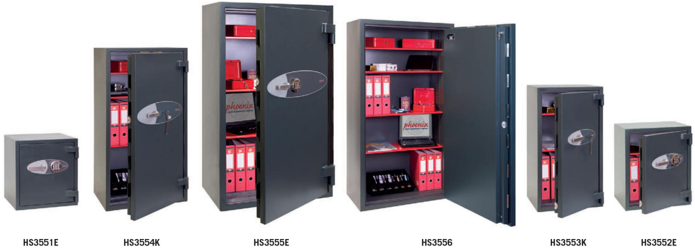
HS3551E HS3554K HS3555E HS3556 HS3553K HS3552E

THE PHOENIX MERCURY HS2050 & ELARA HS3550 SERIES are designed to provide extreme security protection for domestic and business use.