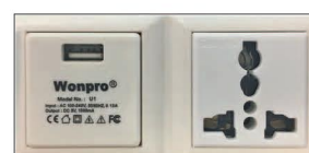
INTERNAL USB & PLUG