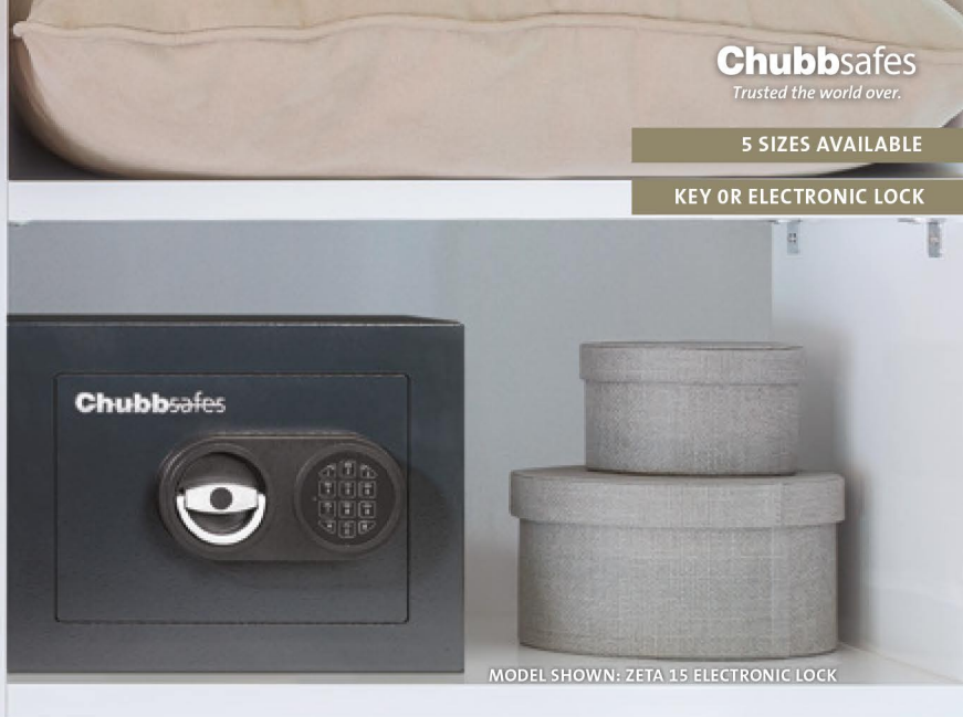
MODEL SHOWN: ZETA 15 ELECTRONIC LOCK