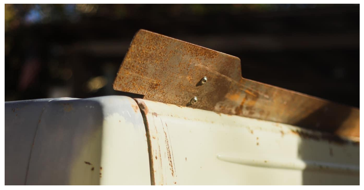
Be sure to check blade clearance over bed sides.

3. Clamp or hold in position. Double check spoiler is in desired position and mark holes to drill for rivnut install. Rivnuts require use of 25/64" drill bit (not included).