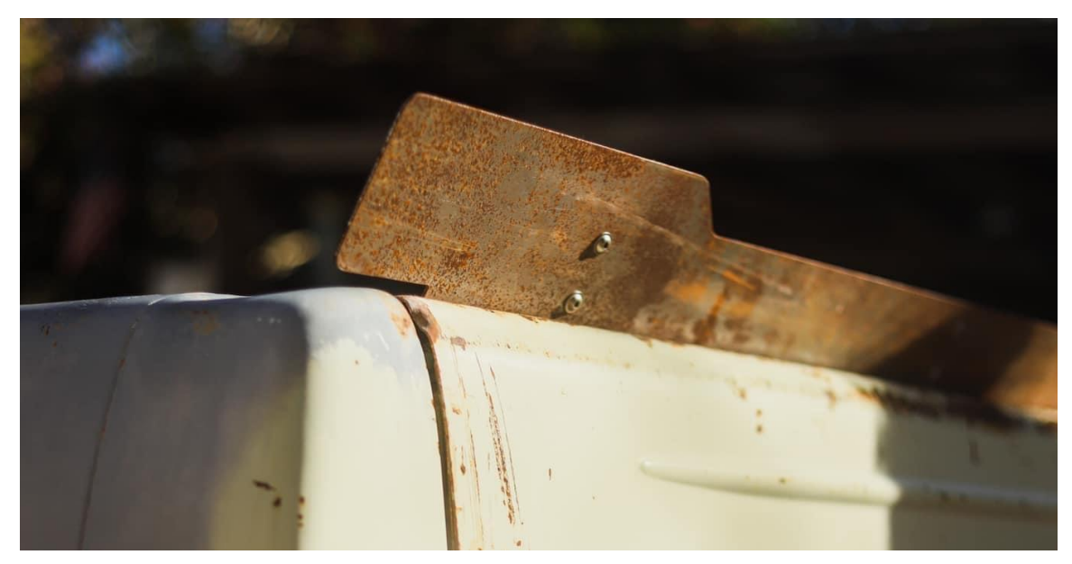
Be sure to check blade clearance over bed sides.

3. Clamp or hold in position. Double check spoiler is in desired position and mark holes to drill for rivnut install. Rivnuts require use of 25/64" drill bit (not included).