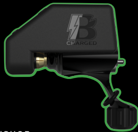
BISHOP® MICROANGELO TATTOO MACHINE