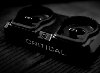
UNIVERSAL BATTERY DOCK