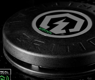
CRITICAL CONNECT FOOT SWITCH