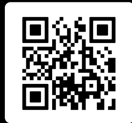
SCAN QR CODE FOR VIDEO LINK MICROANGELO