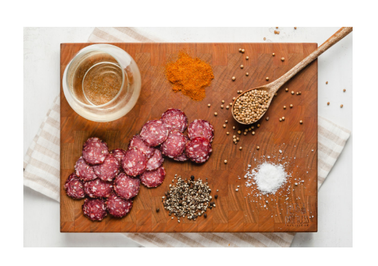
Landjaeger - Bison & Pork, Sea Salt, Spices (including Pepper & Caraway), Dextrose, Garlic, Swiss Chard Powder, Lactic Acid Starter Culture