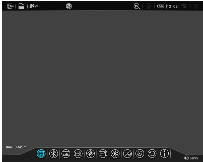
Advanced Settings Interface