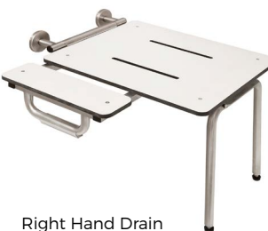
Right Hand Drain

SEAT AREA 16" x 24" ITEM CODE CKIMM500-07-001