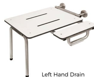
Left Hand Drain

SEAT AREA 16" x 24" ITEM CODE CKIMM500-08-001