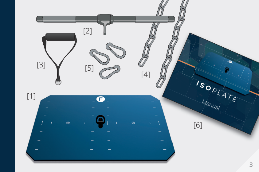
Plate Metal bar Hand attachment Chains x 2 pcs Carabiners x 3 pcs Manual