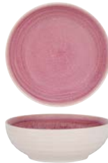
ROUND DEEP BOWL