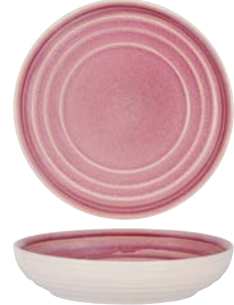
ROUND SOUP / PASTA BOWL