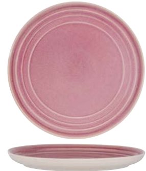
ROUND COUPE PLATE