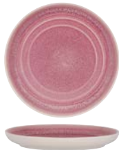
ROUND COUPE PLATE

TABLEKRAFT'S URBAN LINEA DUSTY PINK ADDS A FRESH POP OF COLOUR TO THE TABLE. CRAFTED WITH A REACTIVE GLAZE , EACH PIECE FEATURES UNIQUE CHARACTERISTICS AND SOPHISTICATED LINEAR LINES , MAKING IT PERFECT FOR COORDINATING WITH OTHER RANGES.