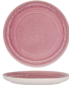
ROUND COUPE PLATE