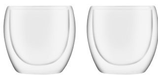
DOUBLE WALL GLASS SET 2pc

Item Code BW9100 Capacity 80ml Ø 67mm Height 64mm