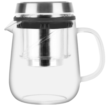
TEAPOT WITH SCREW INFUSER

Item Code BW9121 Capacity 600ml Dimensions 175x115mm Height 100mm