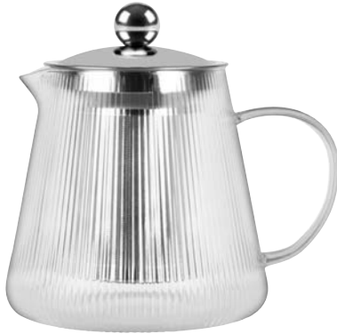
TEAPOT WITH VERTICAL STRIPES

PRODUCING RICH FLAVOURS, BREW INFUSION RANGE OF PLUNGERS & TEAPOTS BREW YOUR PERFECT POT . INFUSION ALLOW YOU TO CONTROL YOUR COFFEE OR TEA'S STRENGTH AND TASTE , GIVING YOU AN EXPERT BLEND EVERY TIME.