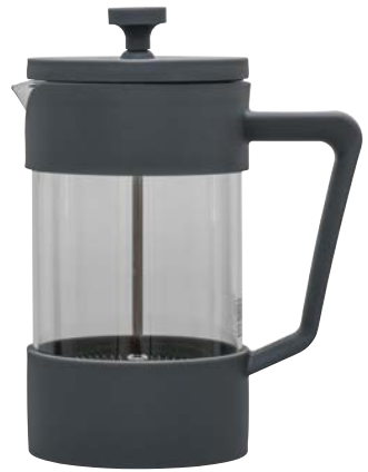
TEA / COFFEE PLUNGER GREY

Item Code BW9006 Capacity 600ml Dimensions 145x90mm Height 185mm