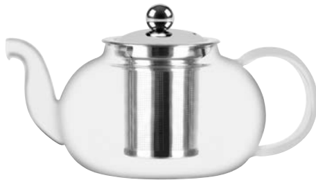
TEAPOT WITH INFUSER

Item Code BW9122 Capacity 600ml Dimensions 135x100mm Height 145mm