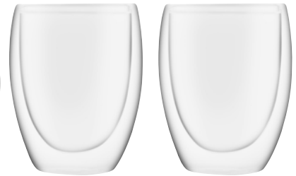
DOUBLE WALL GLASS SET 2pc

Item Code BW9101 Capacity 220ml Ø 89mm Height 89mm