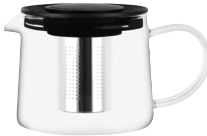
TEAPOT WITH PP LID

Item Code BW9120 Capacity 600ml Dimensions 160x130mm Height 165mm