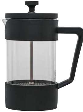
TEA / COFFEE PLUNGER BLACK

Item Code BW9000 Capacity 350ml Dimensions 120x70mm Height 170mm