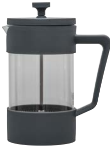
TEA / COFFEE PLUNGER GREY

Item Code BW9002 Capacity 1000ml Dimensions 170x100mm Height 210mm