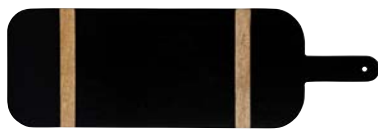
RECTANGULAR PADDLE BOARD

Item Code 04974 Dimensions 560x180mm Height 15mm Black Acacia with Acacia Inlay