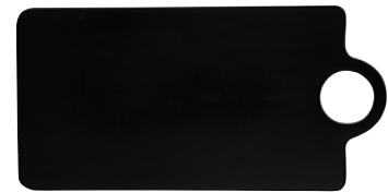
RECTANGULAR PADDLE BOARD

04975 280x190mm 25mm Black Acacia with Loop Handle