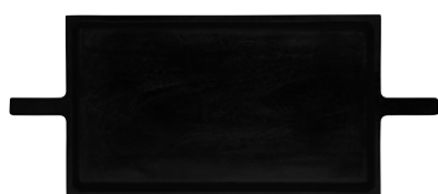
RECTANGULAR PADDLE BOARD

Item Code 04981 Dimensions 580x254mm Height 15mm Black Acacia with 2 Handles