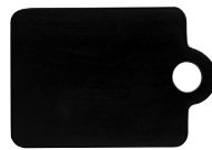
RECTANGULAR PADDLE BOARD

Item Code 04974 Dimensions 560x180mm Height 15mm Black Acacia with Acacia Inlay