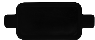
RECTANGULAR PADDLE BOARD

04979 440x370mm 15mm Black Acacia with Loop Handle