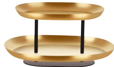
SEAFOOD STAND 2-TIER

Item Code 06990 Overall Dimensions 385x260mm Height 195mm Top Tier Dimensions 305x205x25mm Bottom Tier Dimensions 385x260x30mm Material Stainless Steel / Black Iron