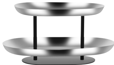
SEAFOOD STAND 2-TIER

Item Code 06990 Overall Dimensions 385x260mm Height 195mm Top Tier Dimensions 305x205x25mm Bottom Tier Dimensions 385x260x30mm Material Stainless Steel / Black Iron