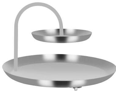
ROUND SEAFOOD STAND 2-TIER