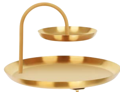
ROUND SEAFOOD STAND 2-TIER