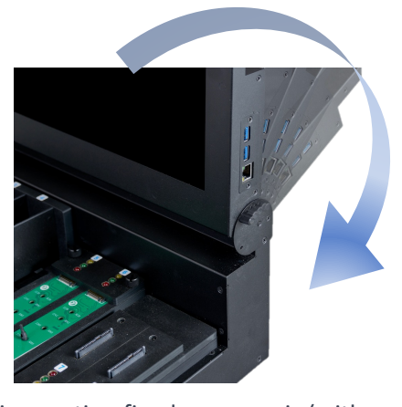
Five-section fixed screen axis (with screws on both sides), adjustable according to the user's perspective.