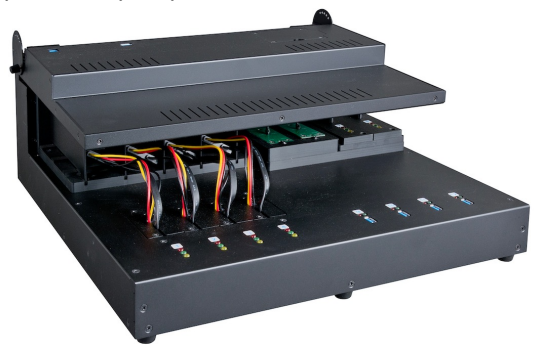
When not in use, the screen can be folded, reducing the overall volume.

Folding screen design reduces the overall size of the eraser, while the five-section fixed screen axis is better aligned with the operator's perspective.