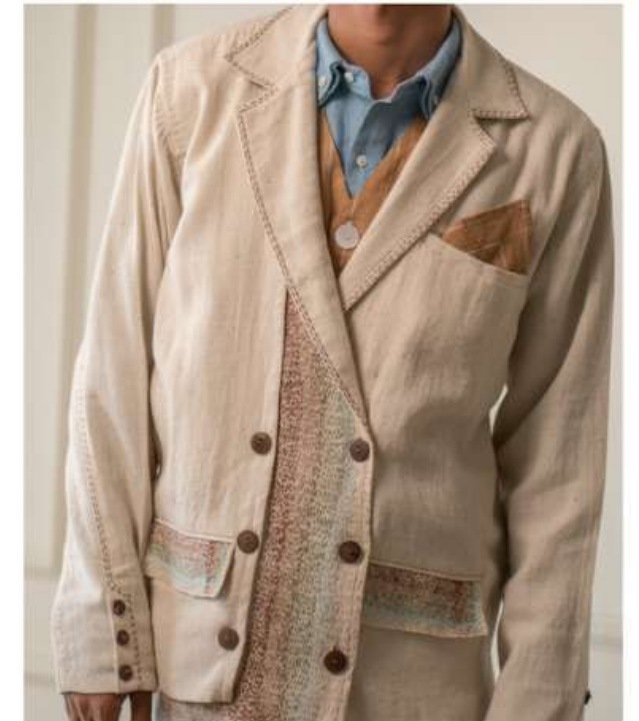
| Materiality Cuff Detail Shirt | L/MS/S24