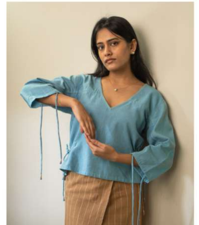
| Materiality Reversible Ruched Blouse | L/WS/S04