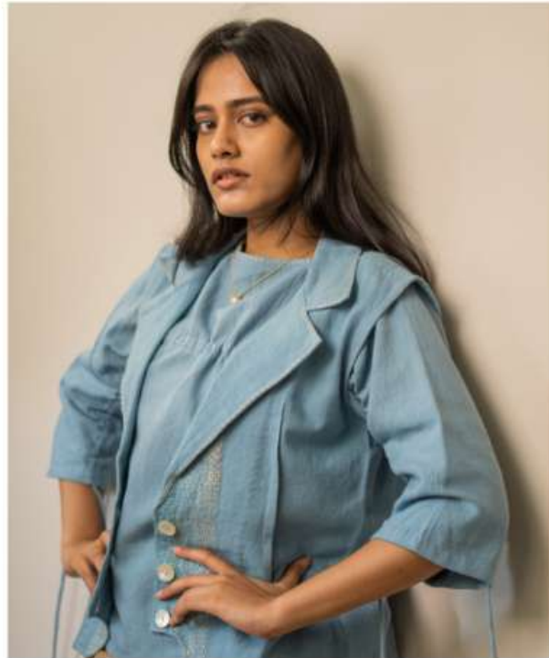
| Materiality Long Vest | L/WJ/J11