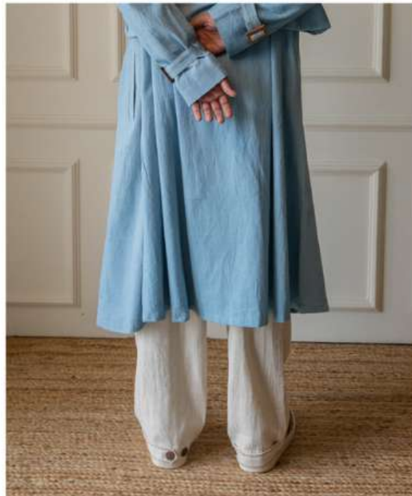
| Materiality Pleated Straight Pants | L/MP/P10