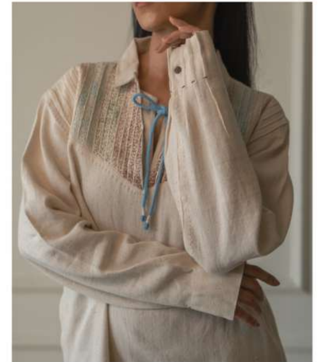
| Materiality Unisex Reversible Jacket | L/UJ/J16