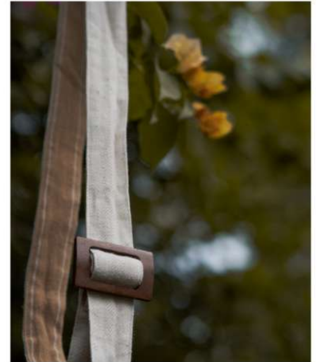
| Materiality Upcycled Reversible Belt | L/AC/BT03