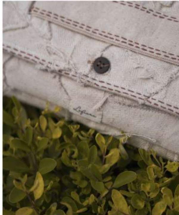
| Materiality Upcycled Drawstring Bag | L/AC/B05