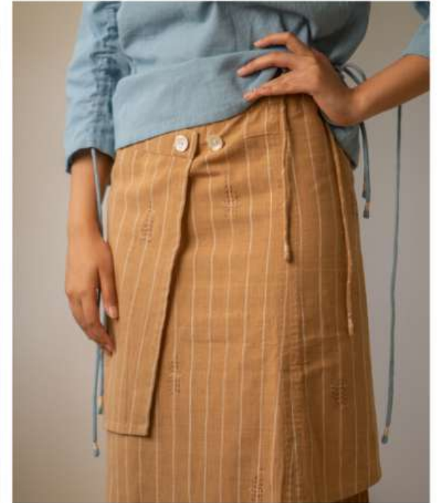
| Materiality Wrap Around Skirt | L/WSK/SK07