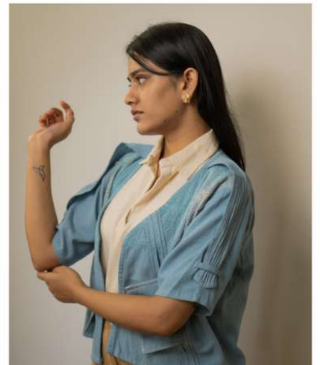
| Materiality Unisex Cropped Half Sleeve Jacket | L/UJ/J20