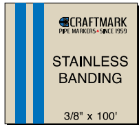
Stainless Steel Banding