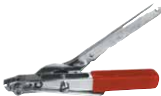
Stainless Steel Banding Clip Crimping Tool