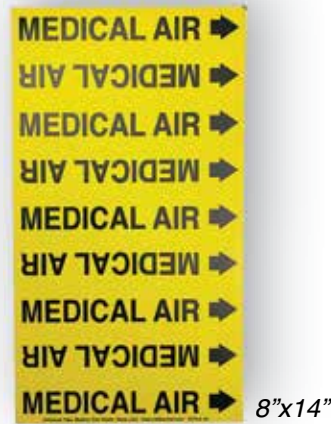
STYLE M1 To Fit 2 1/8" - 3" Pipes 1 marker per card