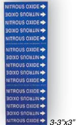
STYLE M3 To Fit 3/8" - 3/4" Pipes 3 markers per card