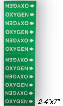
STYLE M2 To Fit 1" - 2" Pipes 2 markers per card