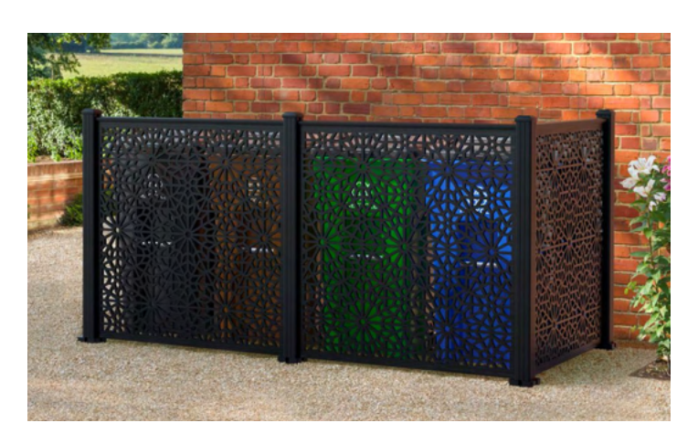
Alnara in black, 3 bin screens - 120cm x 120cm