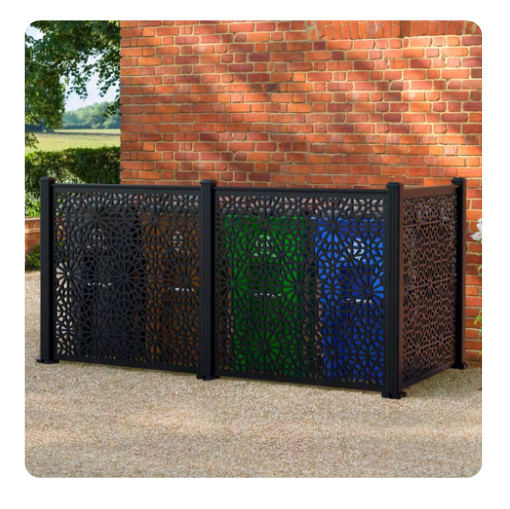
Assembled 4 Bin Screen 120cm (Height), 240cm (Width), 120cm (Depth)