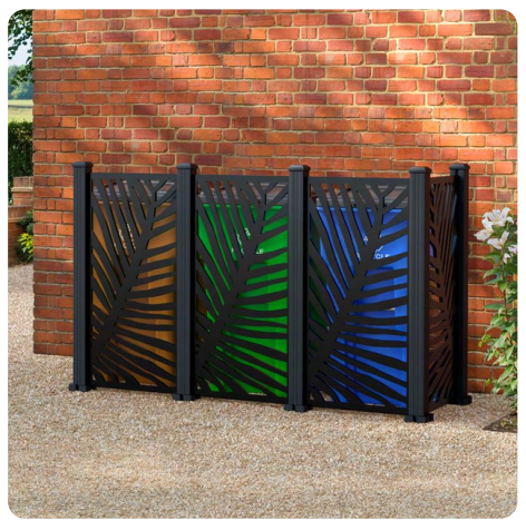
Assembled 3 Bin Screen 120cm (Height), 180cm (Width), 60cm (Depth)