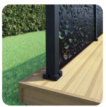
Fix to a wooden surface Installation