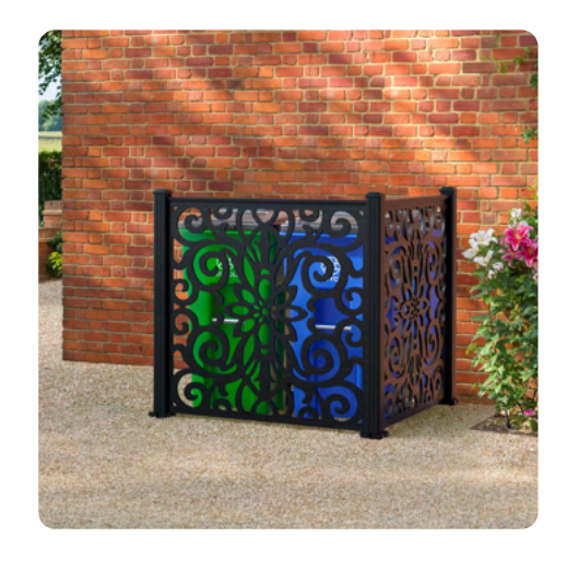
Assembled 2 Bin Screen 120cm (Height), 120cm (Width), 120cm (Depth)