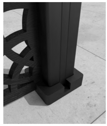
Post base plate cover