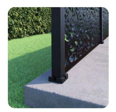
Solid ground Installation

Watch our helpful videos on our website for step-by-step guidance.