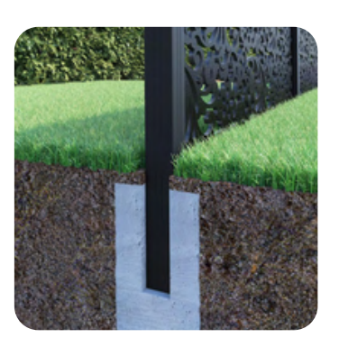
Buried into the ground Installation