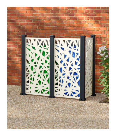
Prism in ivory - aluminium posts

We offer a variety of elegant styles, in 20 designs, 3 different sizes and 4 chic colors, making our premium bin screening system the ultimate choice for those who desire a luxurious and sophisticated outdoor experience.