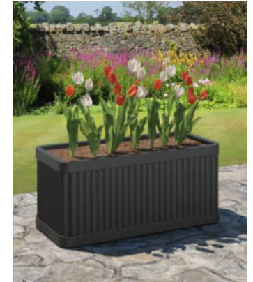
Plumley Medium Dark Grey Planter Base