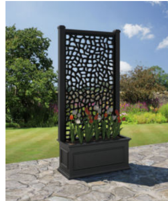
Windsor Medium Dark Grey Planter with Pebble Screen in Black

Position the decorative screen at the back or in the centre for versatile planting options, and upgrade with our optional wheeled base, complete with lockable wheels for stability. Embrace privacy, practicality and style with our all-weather planters.