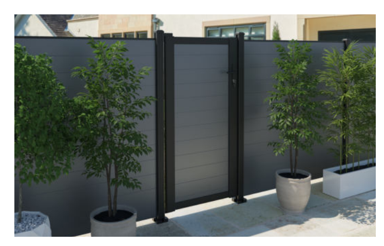
Salone Fence Slat in Gate and Fencing