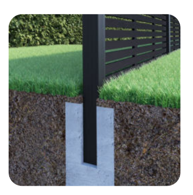
Buried into the ground Installation