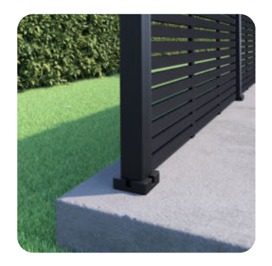
Solid ground Installation

Watch our helpful videos on our website for step-by-step guidance.