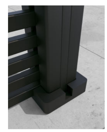
Post base plate cover