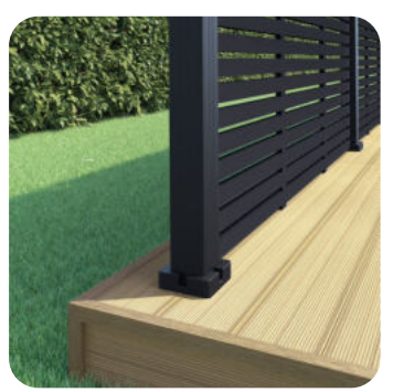
Fix to a wooden surface Installation