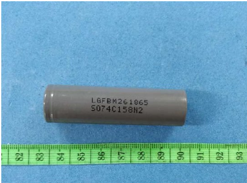
Figure 3 Overall view of cell