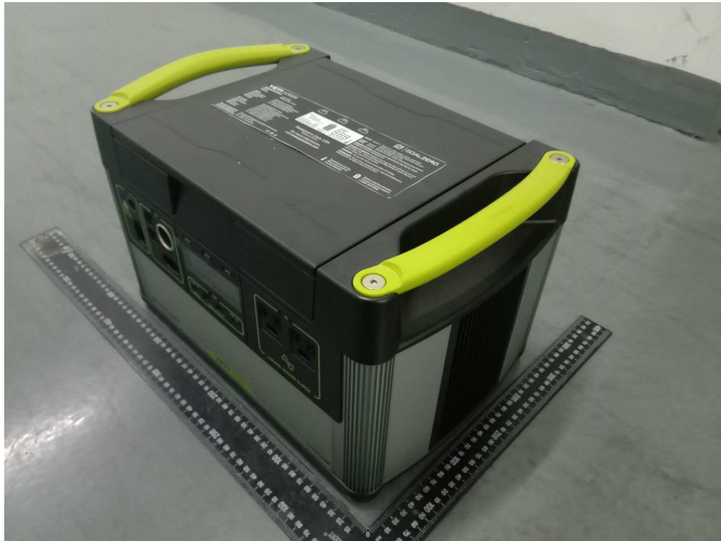
Figure 1 Overall view I of battery