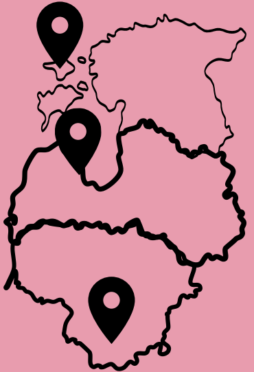
Co-funded by the Ministry of Education and

Overcoming prejudice and finding friends in neighbor countries was the main theme of the project for middle school students who took part in the project.