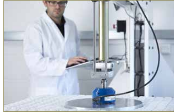
Inventors, innovators and passionate perfectionists