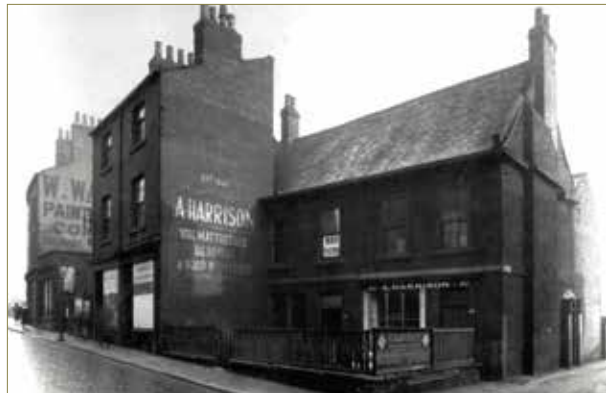
From our family to yours