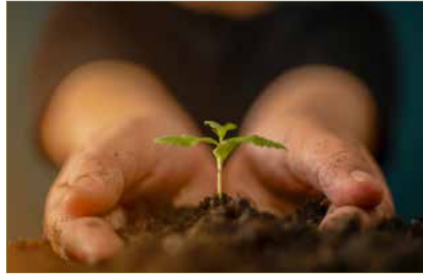
Our beds are home-grown