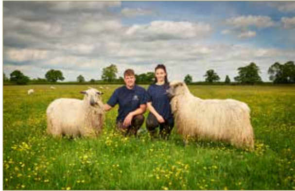
World leaders in sustainable manufacturing