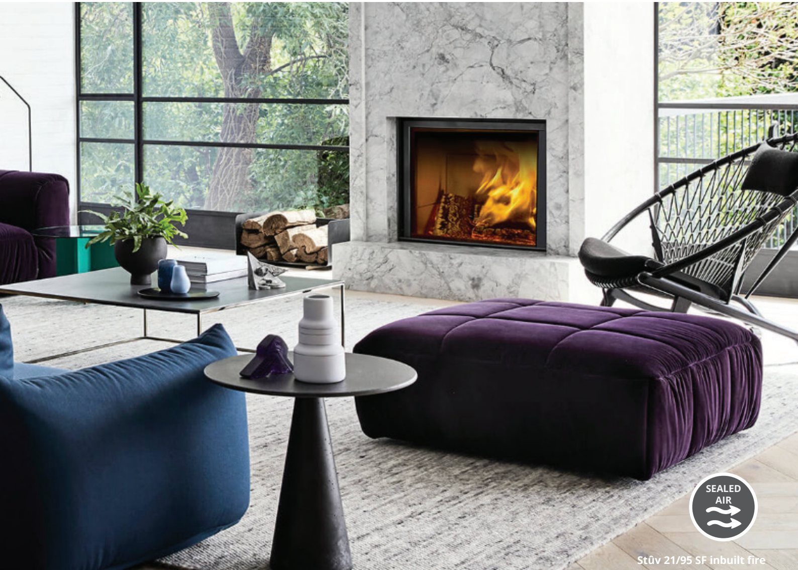
Stûv 21/95 SF inbuilt fire