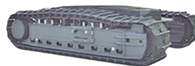
Standard Steel Track