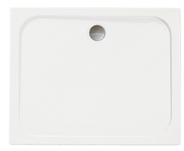
Rectangular tray with Centre waste