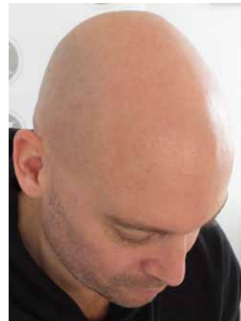
Scalp male before

"Micropigmentation is a way of replicating hair follicles and