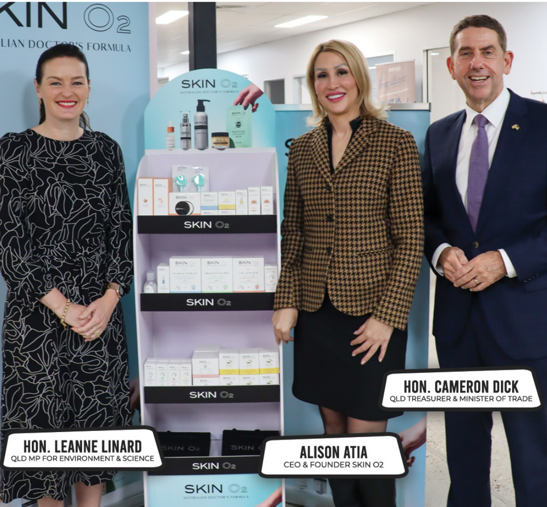
HON. LEANNE LINARD QLD MP FOR ENVIRONMENT & SCIENCE