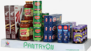
Shelf C (6 sensors)