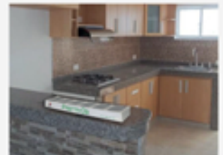
On a kitchen island or a counter top.