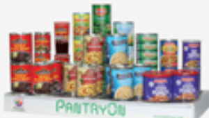
Shelf A (12 sensors)