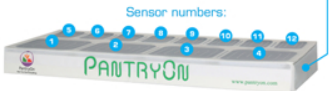
PantryOn Bruno (shelf A)