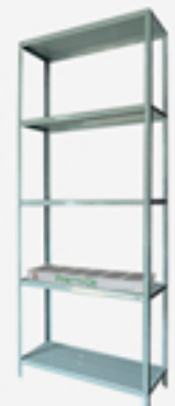
Any space with a solid platform.