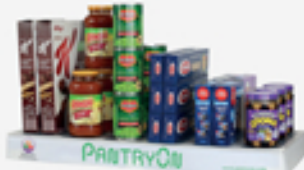
Shelf B (6 sensors)