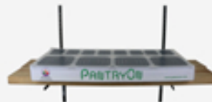
On the wall using shelf brackets with solid platform.