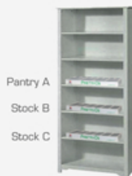
In a cabinet.