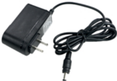
AC power adapter