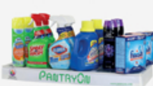
Shelf D (6 sensors)