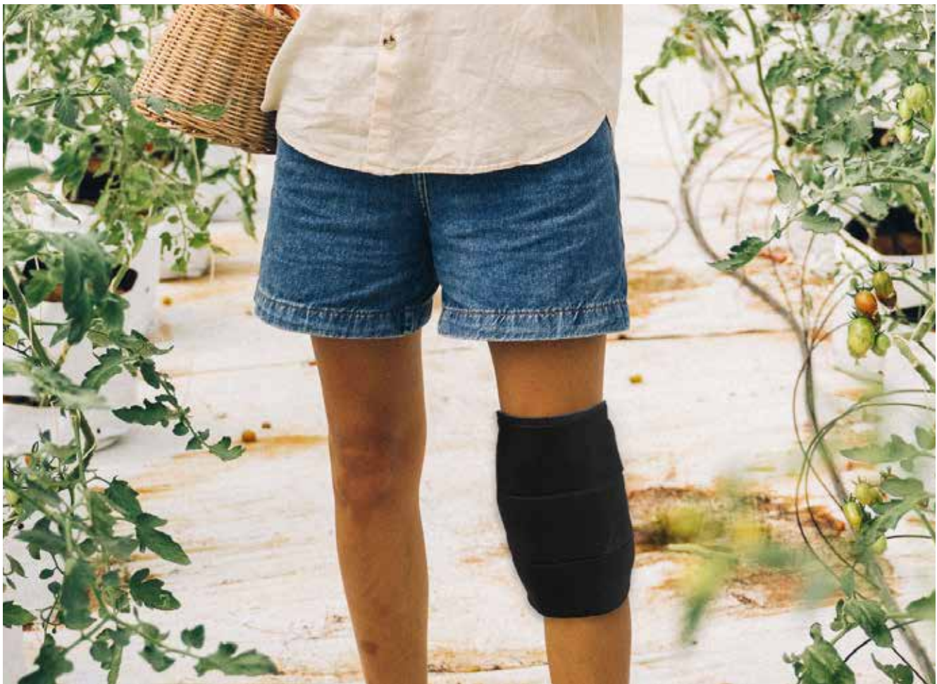
7650 - Universal Knee Compression Wrap Pictured Above

Our patented First Ice® and First Gel® packs allow for accurate, targeted, therapeutic placement of our patented Direct Stick™ packs on our convenient universal wrap. As a result, our joint-targeted knee therapy system is simple to apply, reapply and rotate between user and freezer without any special considerations.