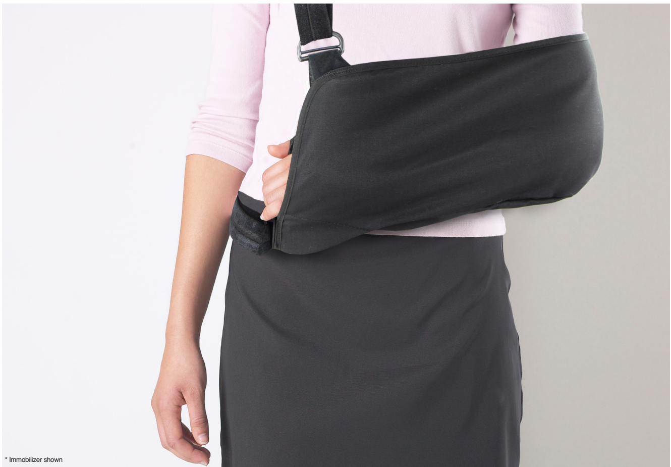
* Immobilizer shown