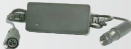
12/24VDC power adapter for car and truck