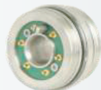
hose connector (to connect 2 hybrid hoses)