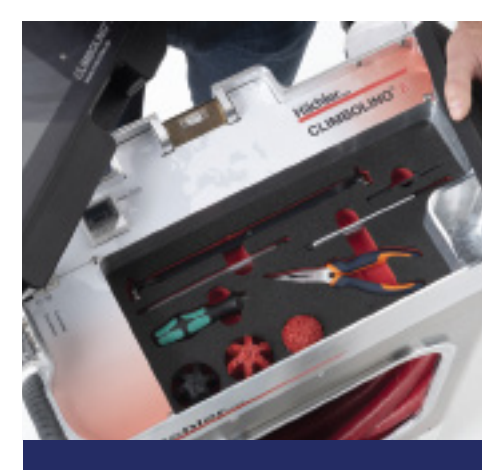
Everything to hand WITH THE INTEGRATED TOOL SET