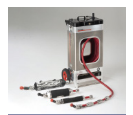
Practical, ergonomic and compact SPACE-SAVING DESIGN FOR EASY HANDLING