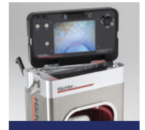
Perfect view and monitoring WITH THE SOPHISTICATED CONTROL UNIT AND EXTRA LARGE DISPLAY