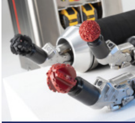
Attachments for every application SPECIALLY DESIGNED MILLING TOOLS FOR EVERY MATERIAL