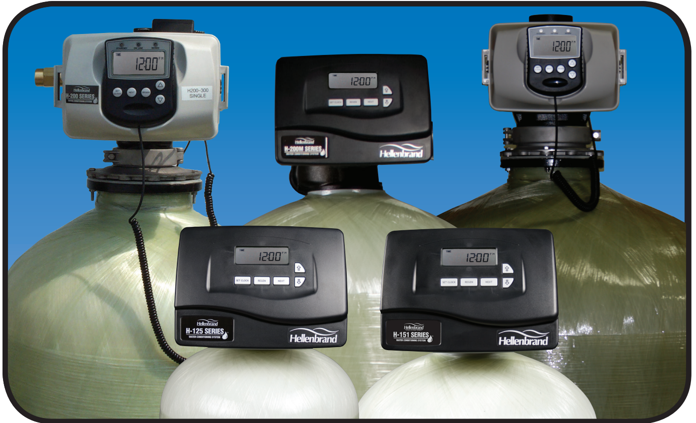
The H-Series Family H125, H151, H200, H200M, H300