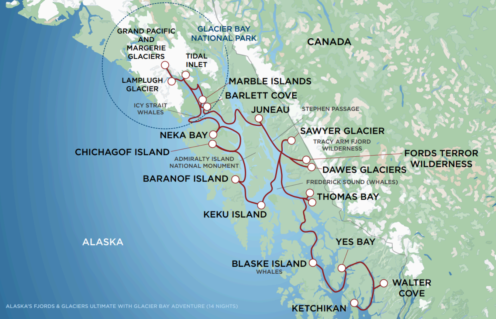
ALASKA'S FJORDS & GLACIERS ULTIMATE WITH GLACIER BAY ADVENTURE (14 NIGHTS)