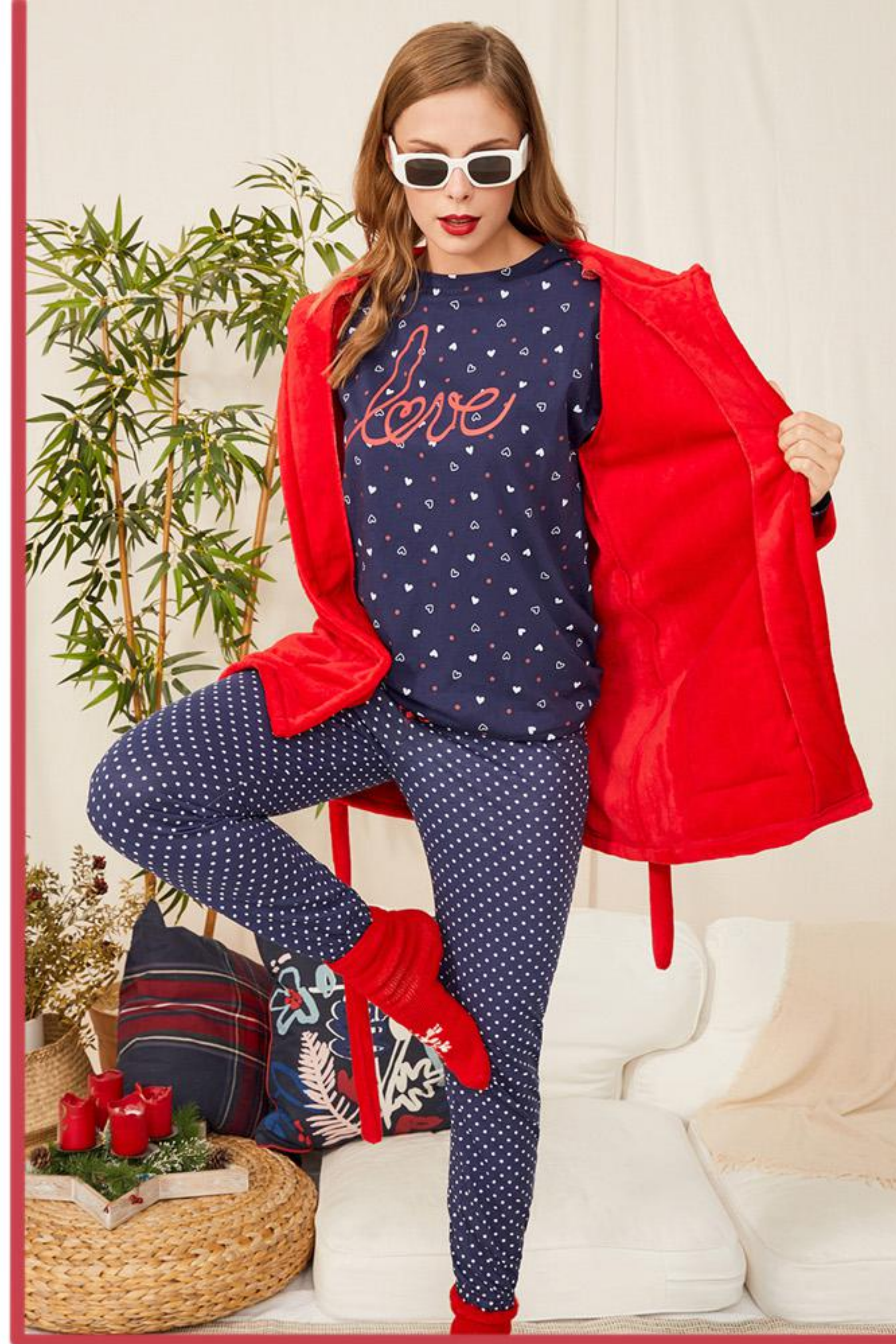
EMWL10052 S-M-L-XL-XXL PJ Set: 100% Cotton Gown: 100% PES