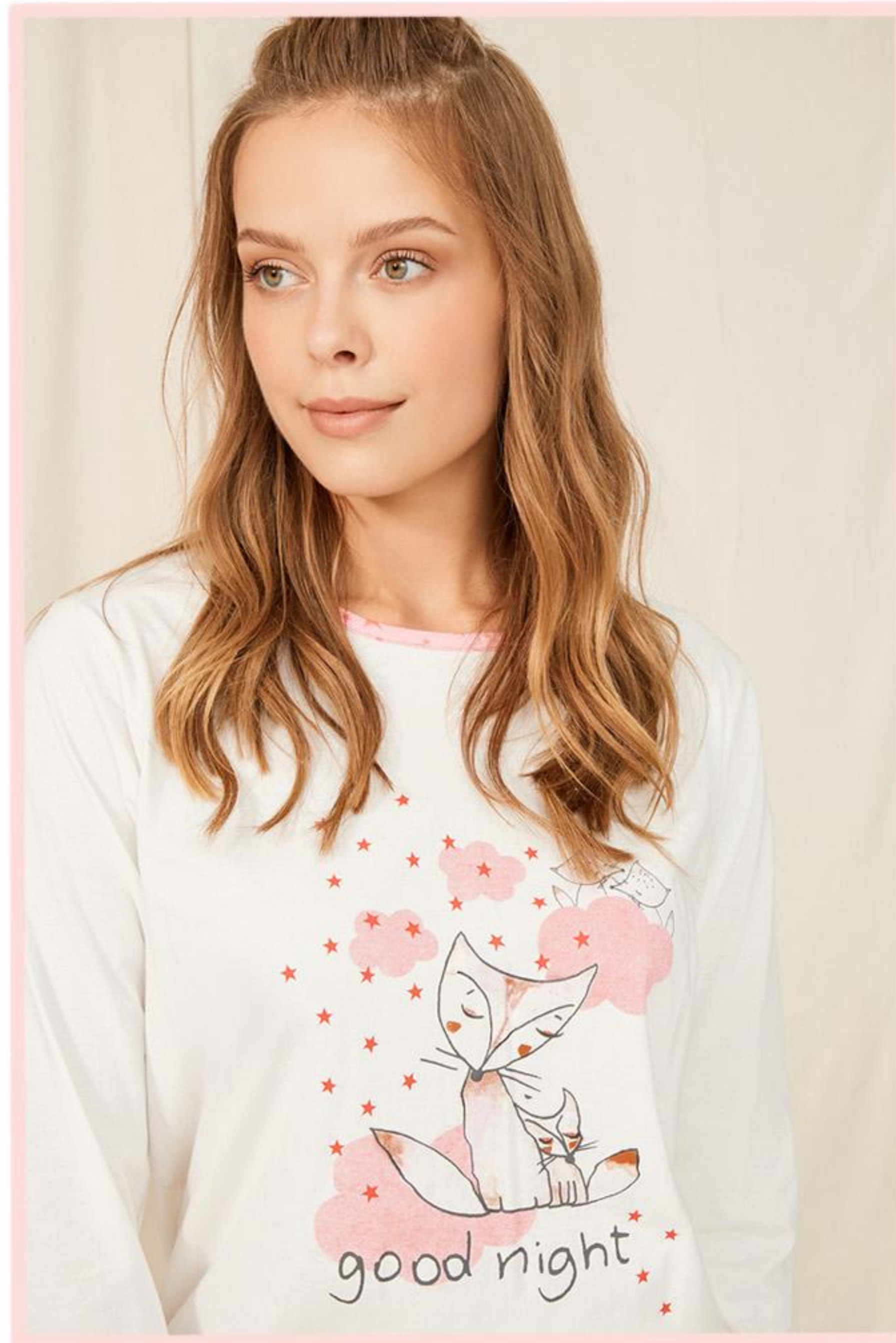
EMWL10016 S-M-L-XL-XXL 100% Cotton