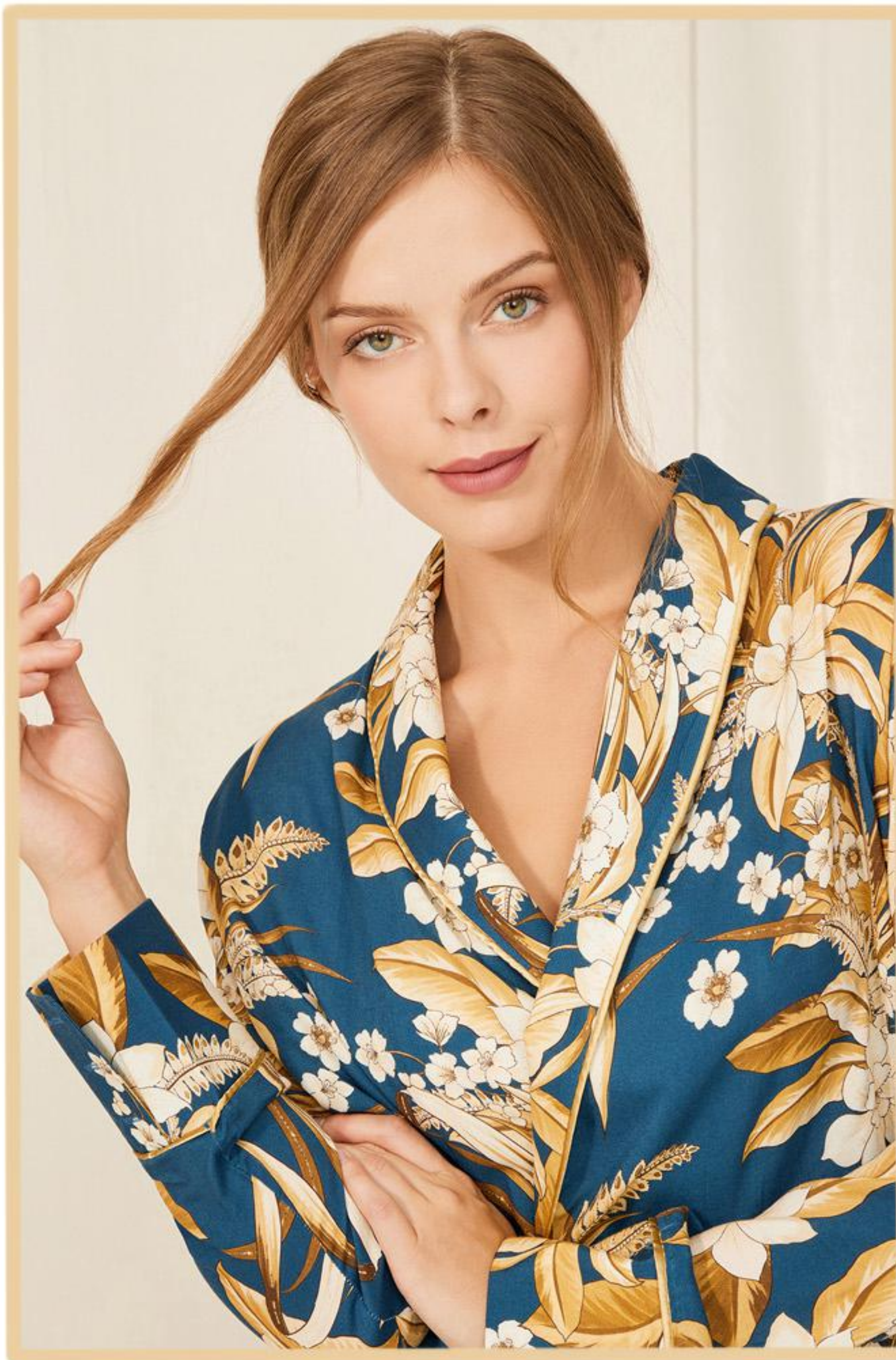
EMWL10000 S-M-L-XL-XXL 100% Viscose