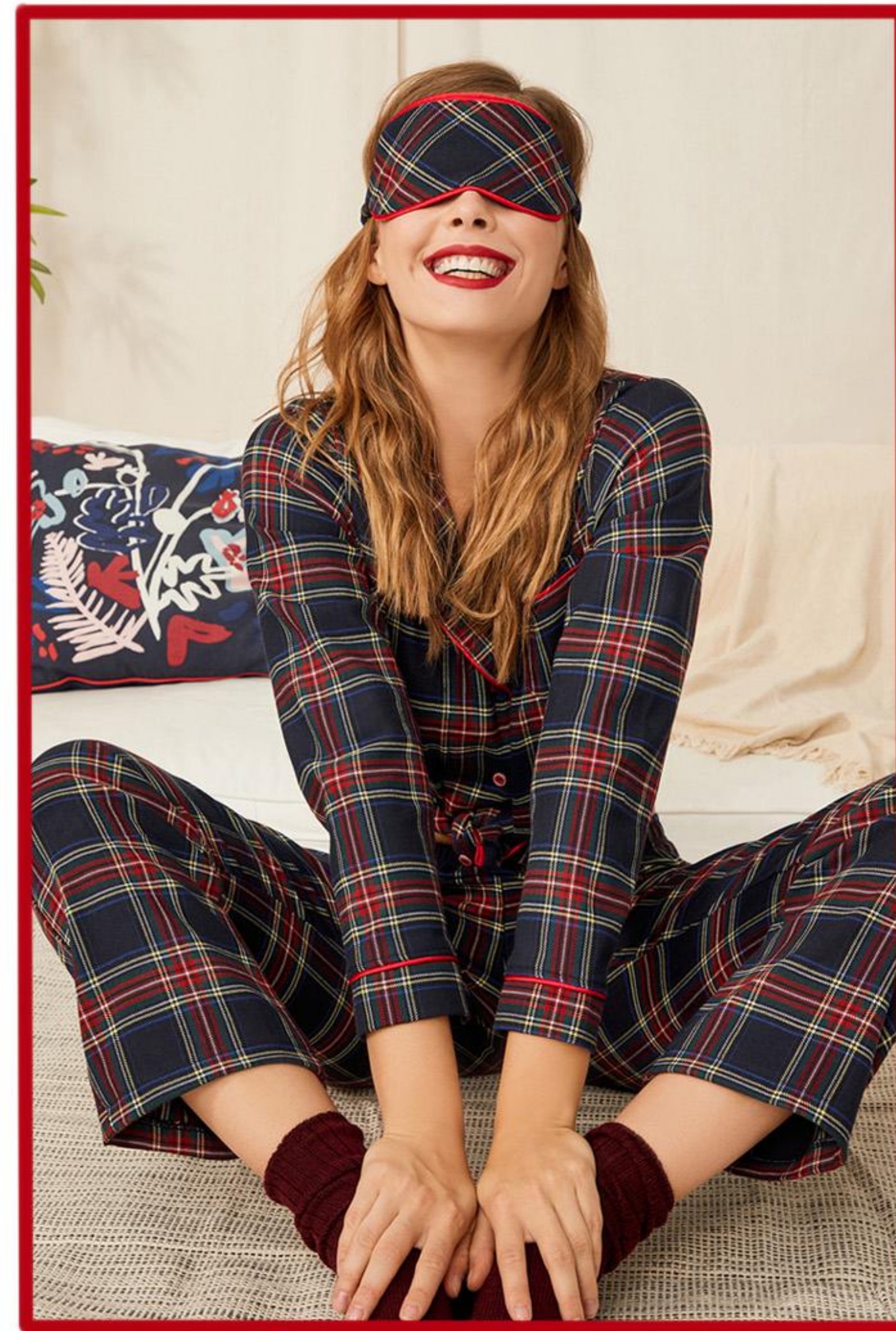
EMWL10040 S-M-L-XL-XXL 70% Viscose, 22%PES, 8% Elastane