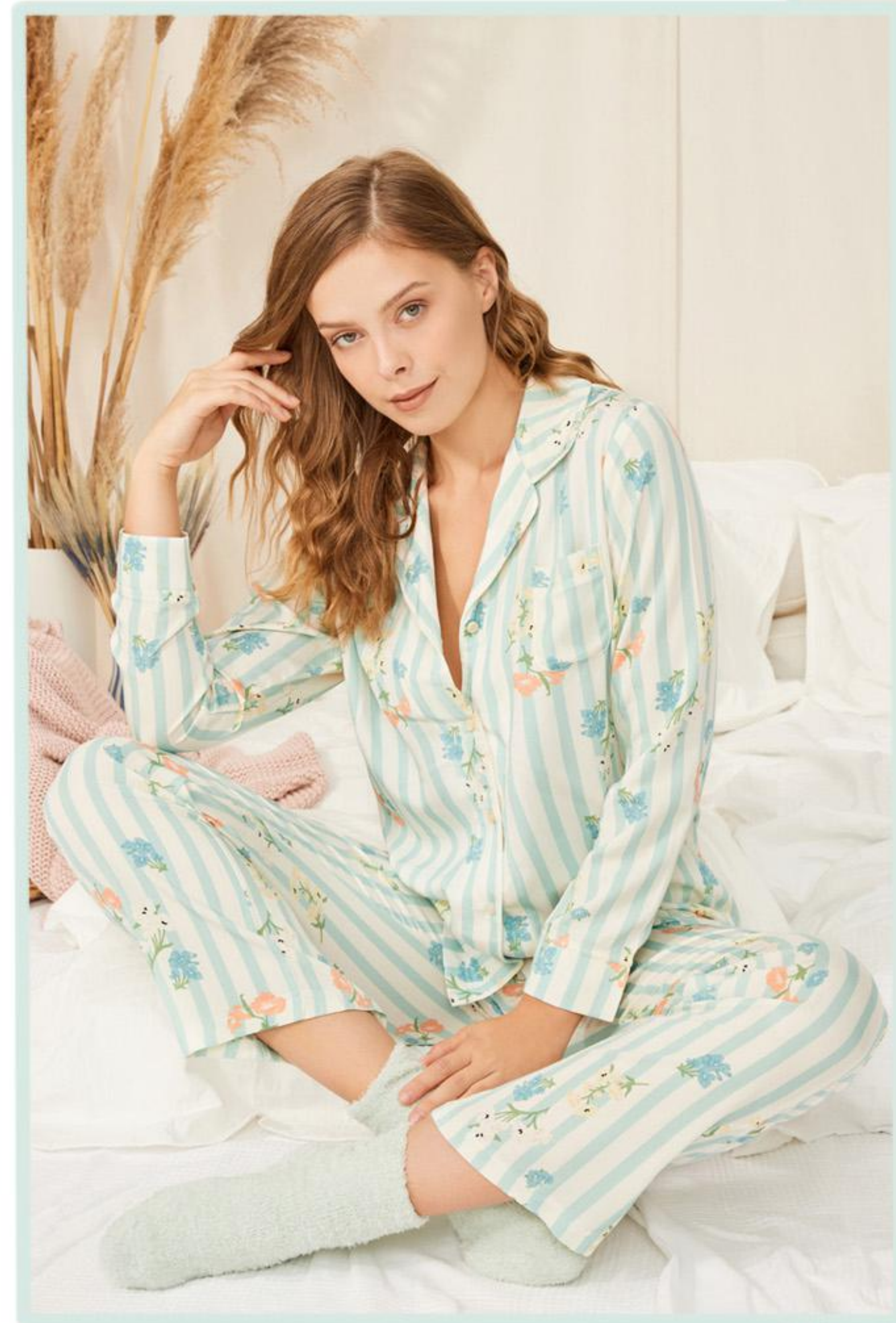
EMWL10006 S-M-L-XL-XXL 100% Viscose