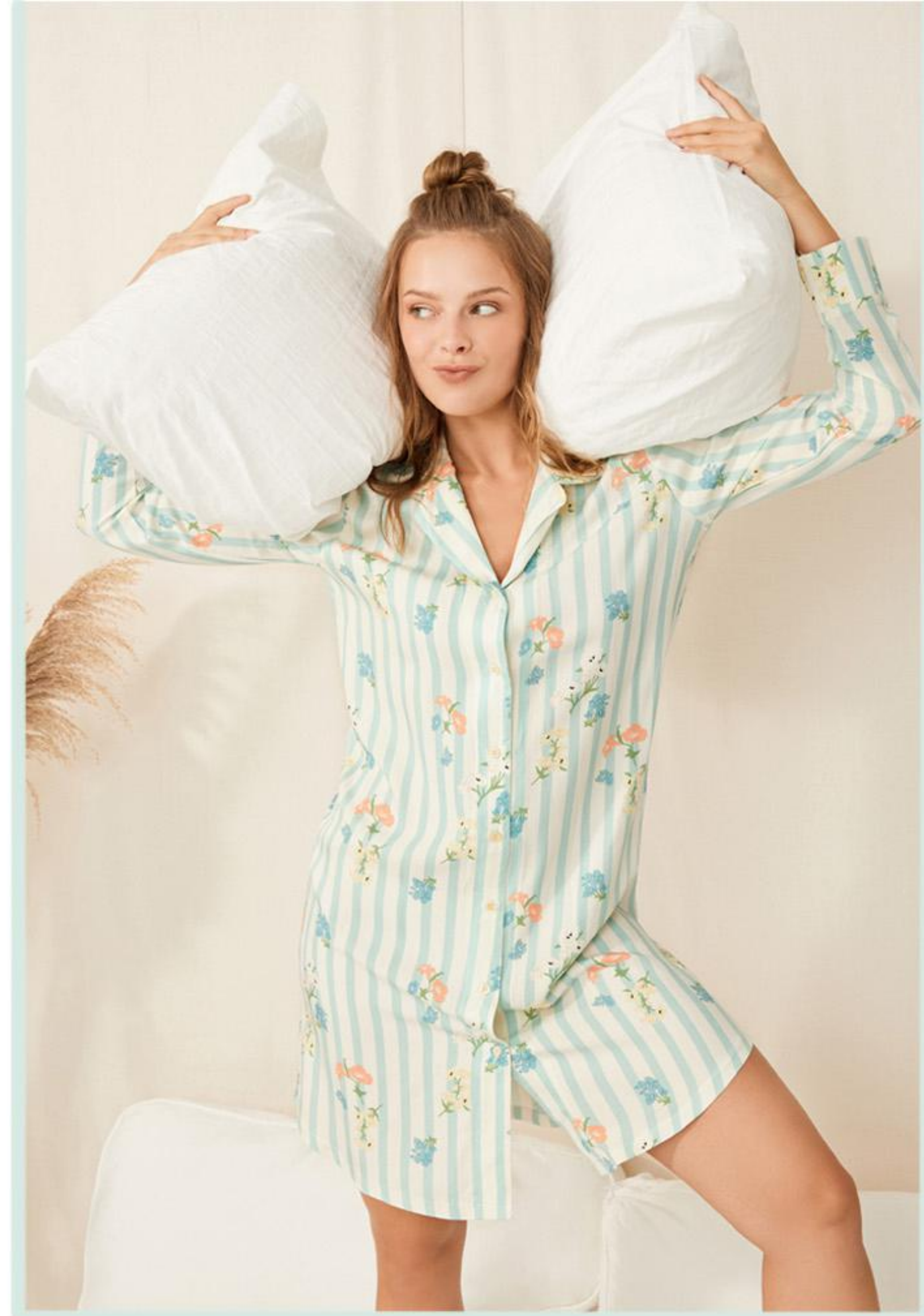
EMWL10004 S-M-L-XL-XXL 100% Viscose