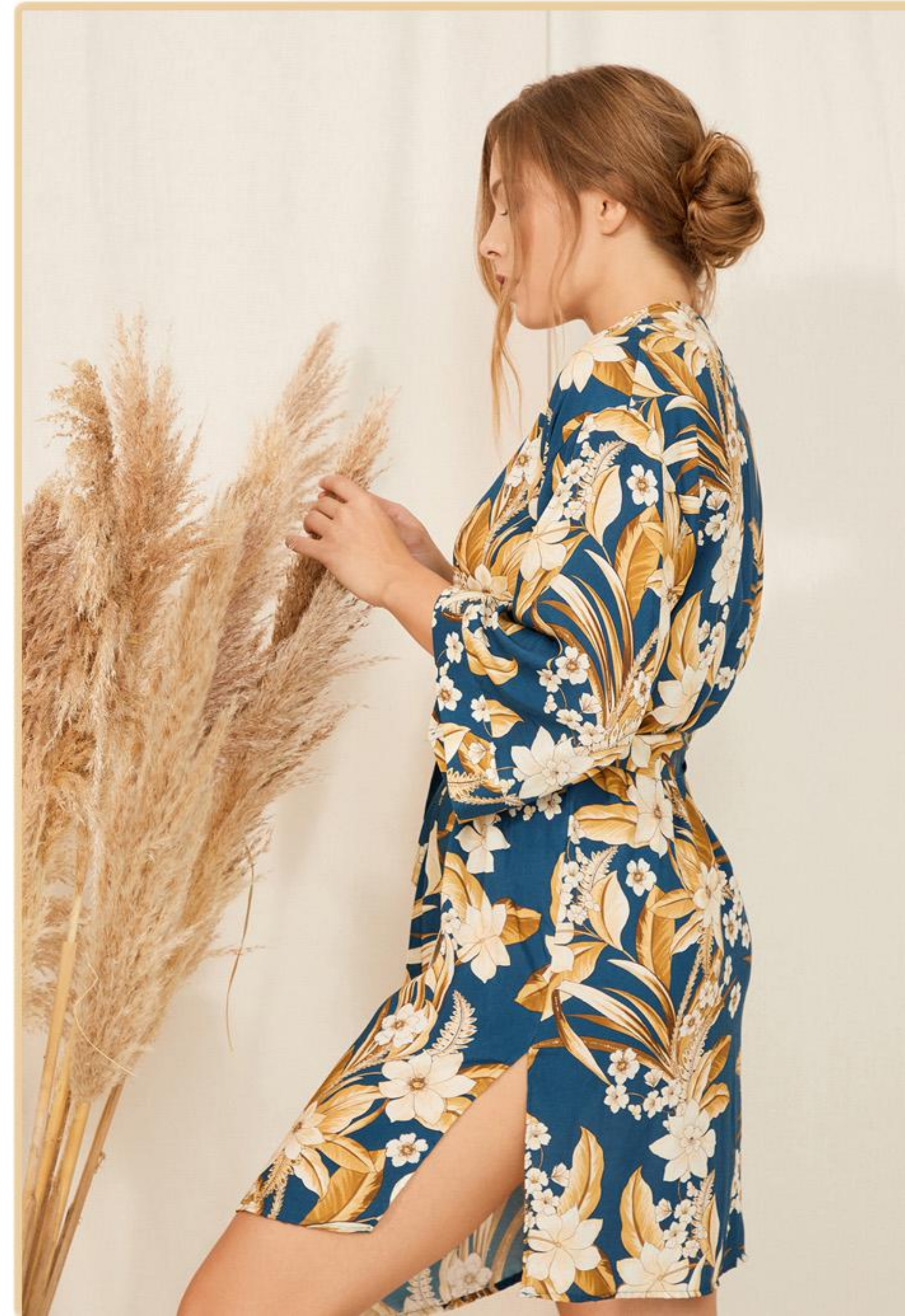
EMWL10002 S/M - L/XL 100% Viscose