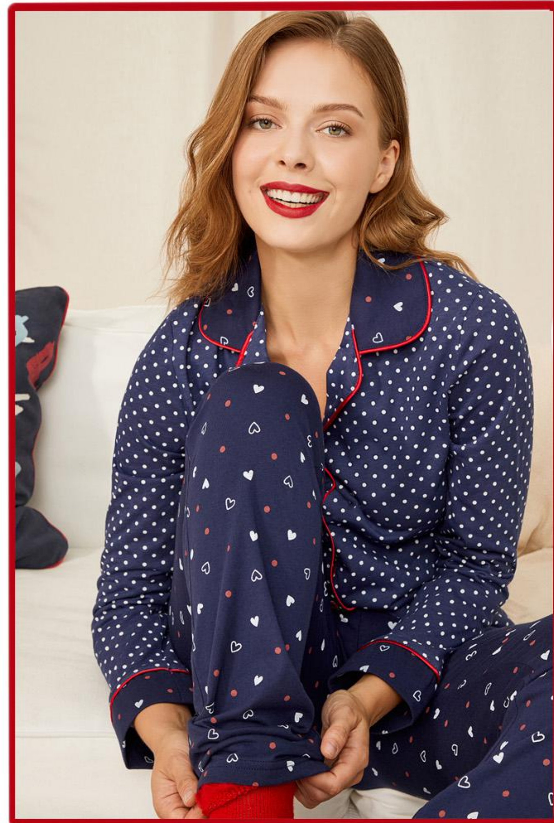
EMWL10054 S-M-L-XL-XXL 100% Cotton