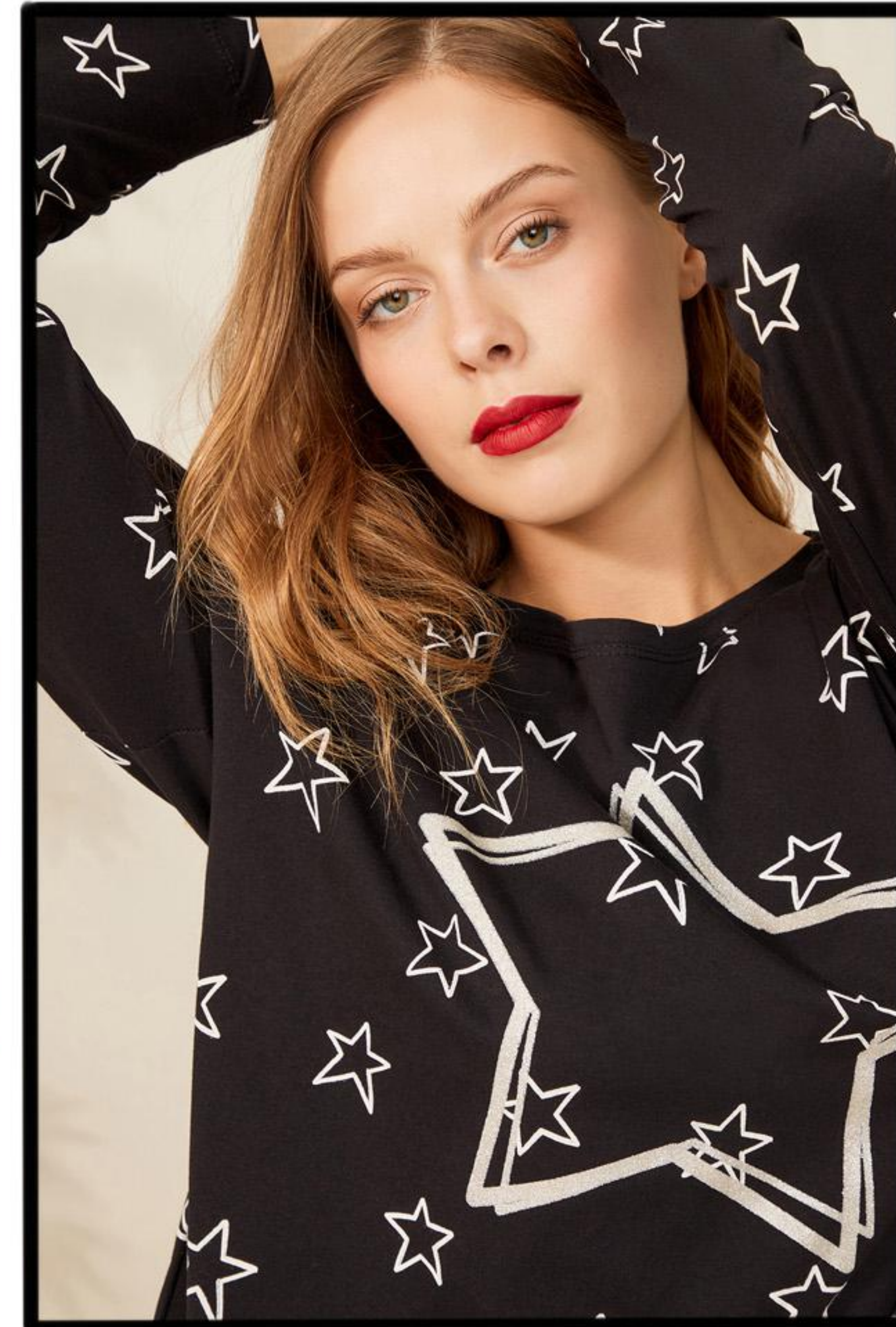
EMWL10056 S-M-L-XL-XXL 100% Cotton