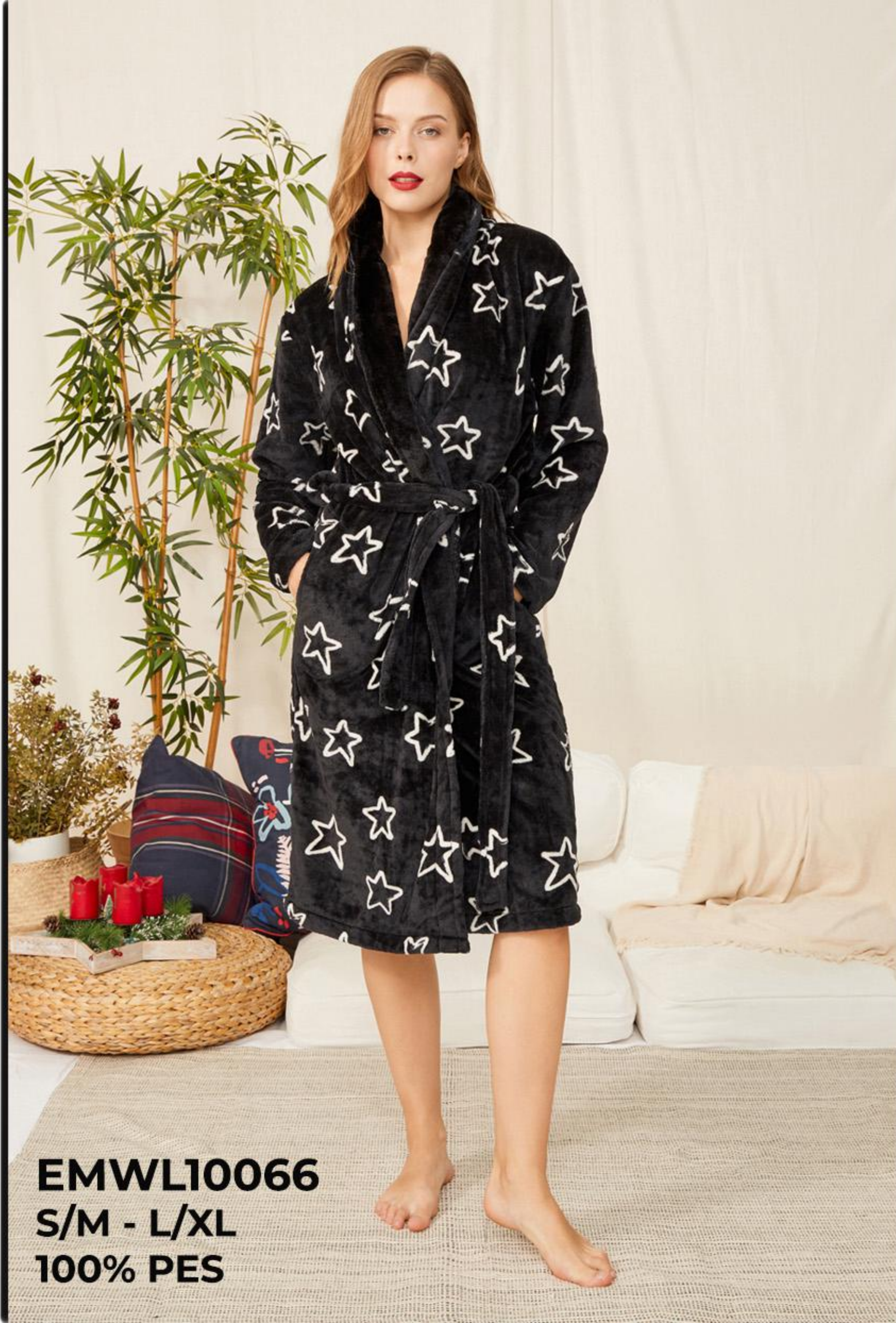
EMWL10066 S/M - L/XL 100% PES