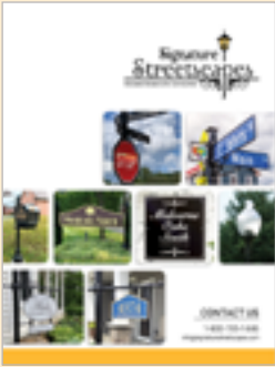
Master Product Catalog