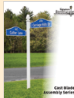
Assembly Series Catalogs