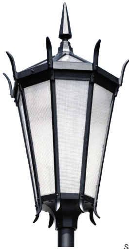
Shown with: Black Finish CA - Clear Acrylic Lens