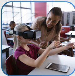
You and your students become content creators