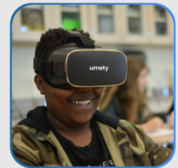
Produce engaging VR presentations