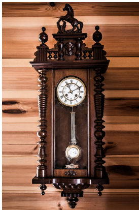
A) PENDULUM CLOCK