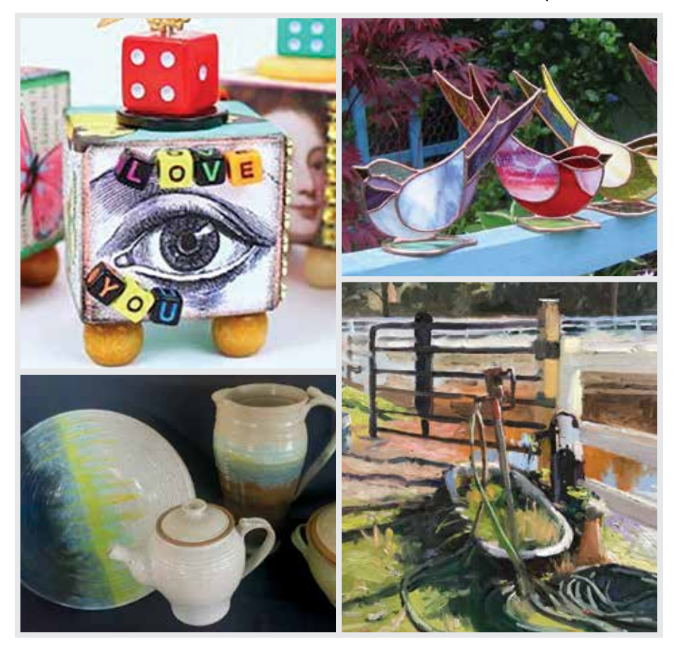
Summer-Fall • June-December 2024 • Adults and Children