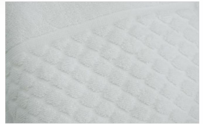
Close-up of Diamond border