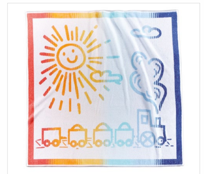
Multi-colored woven ,sun'