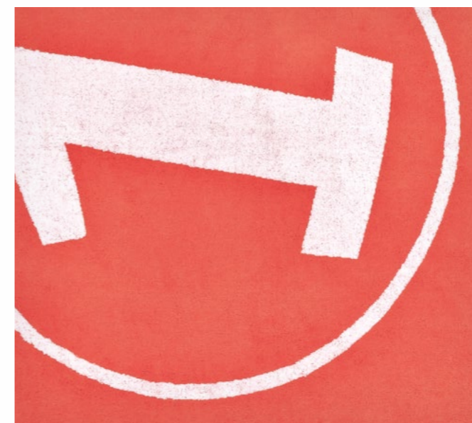
All-over colored woven