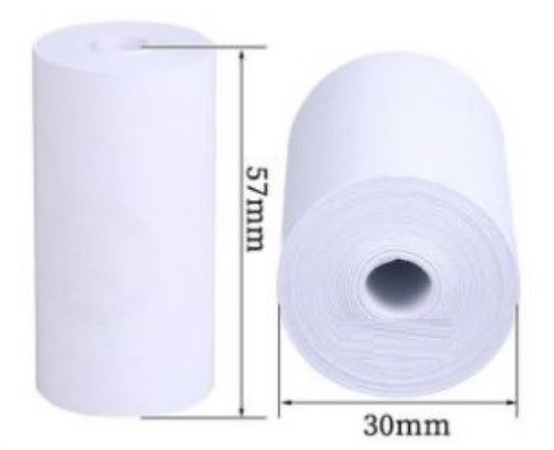
Thermal Printer Paper