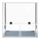
Folding acrylic front window, down part with free stop function