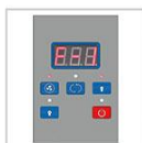
LED Display Digital LED display: Airflow Level