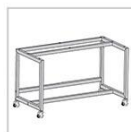
Base Stand Optional