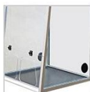
Three Side Glass Windows Back&Side glass windows maximize light and visibility, providing a bright and open working environment