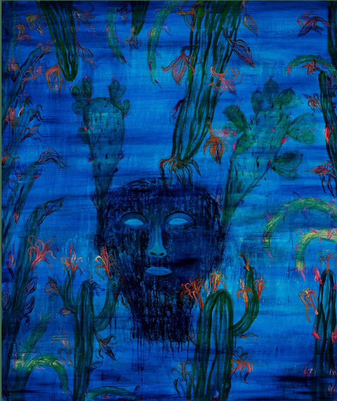
Cactus Man #4 2021, acrylic on Belgian linen, 137x115cm $ 18,800