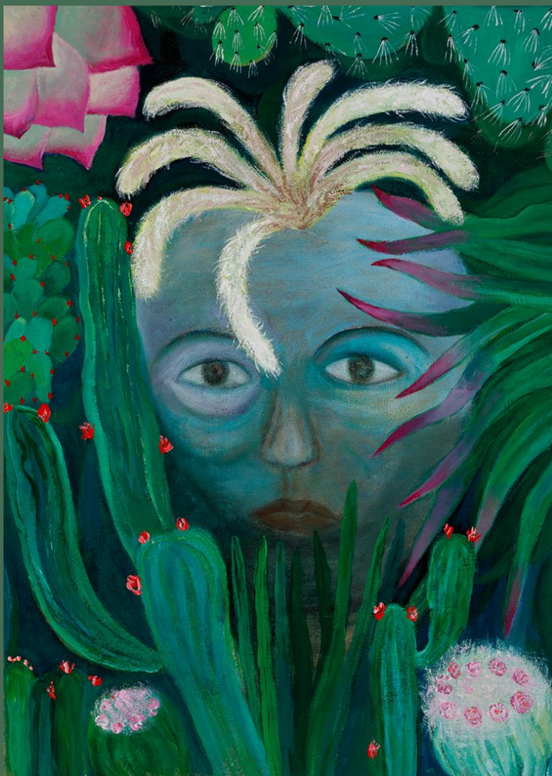
Cactus Man #2 2020, acrylic on Belgian linen, 60x44cm $ 6,000