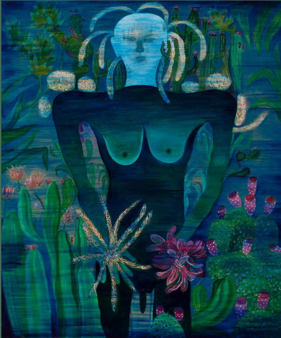
Cactus Man #1 2020, acrylic on Belgian linen, 137x115cm $ 18,800