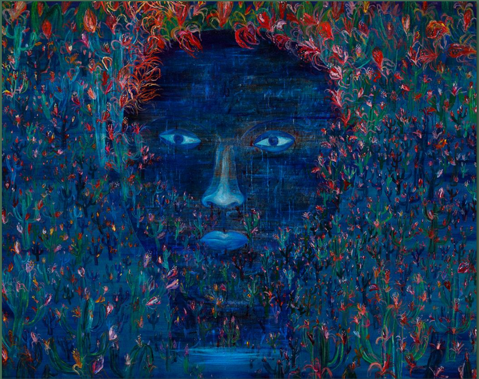
Cactus Man #3 2021, acrylic on Belgian linen, 155x201cm $ 36,000